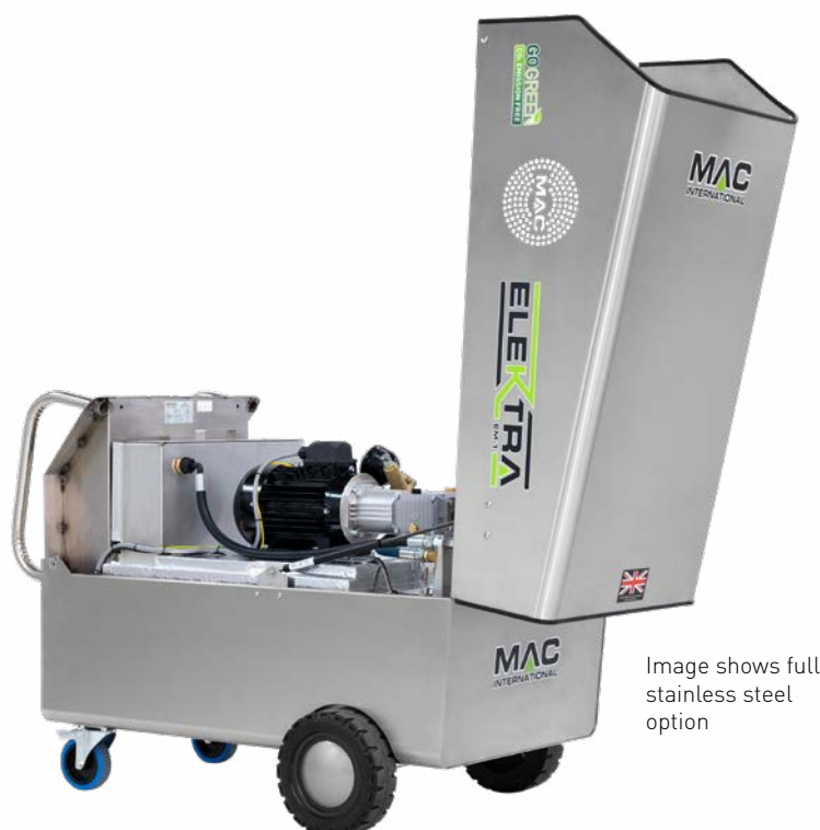
Image shows full stainless steel option